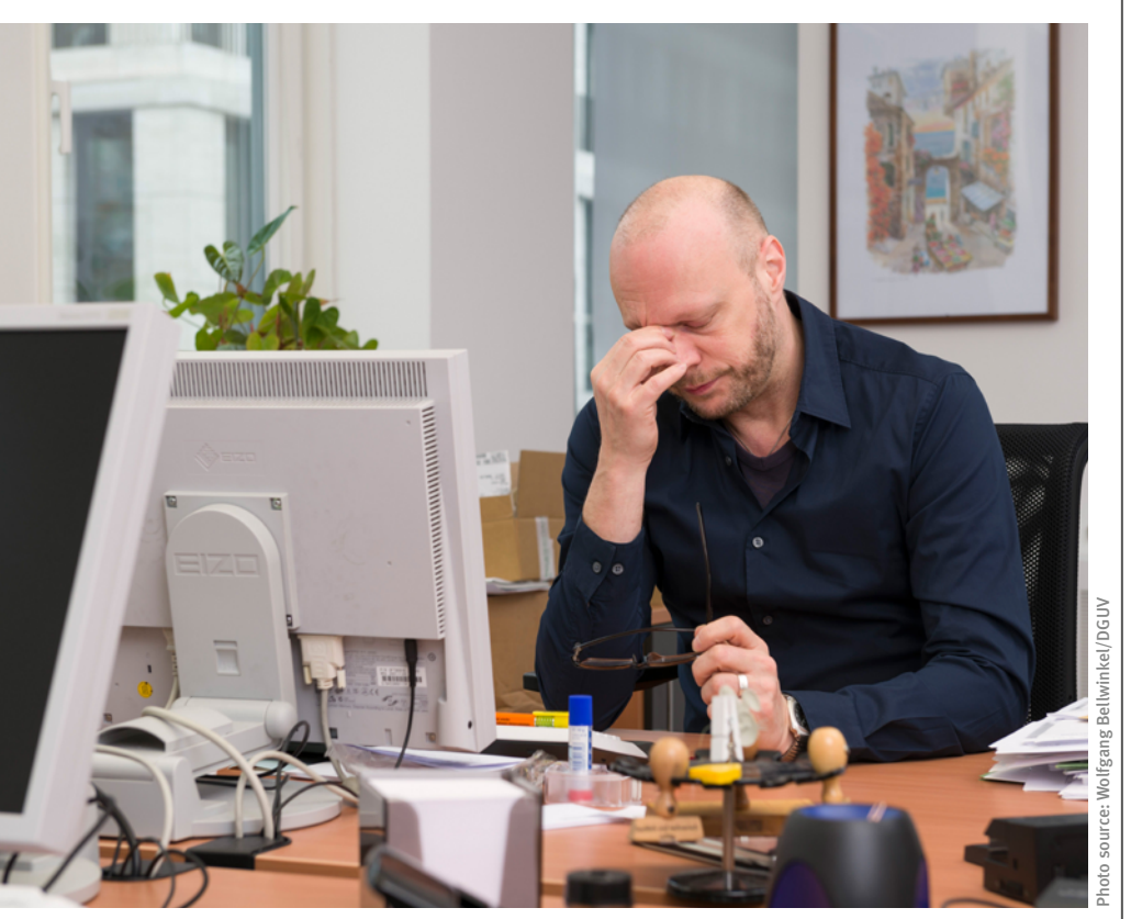
Mental stress and strain in the working environment can have very different causes. It is important to talk about them. The dialogue boxes from the kommmitmensch prevention campaign are a good starting point for this. They are available for the education sector and companies as card sets or in digital form.

mediately thought: "This is the right instrument for our detailed analysis!" As part of a research project, we adapted the dialogues thematically and evaluated them successfully. In the course of our game, which is also dialogue-based, the workshop group developed a common understanding of the status quo of their own prevention culture. Subsequently, real-life examples from everyday work are collected and initial suggestions for measures are written down. A commission with equal employer and employee representation pools these and puts together a concrete package of measures. In my view, success is guaranteed by an open, blame-free culture that encourages discussion, a participatory approach and a clear definition of the manager's role in the overall process.