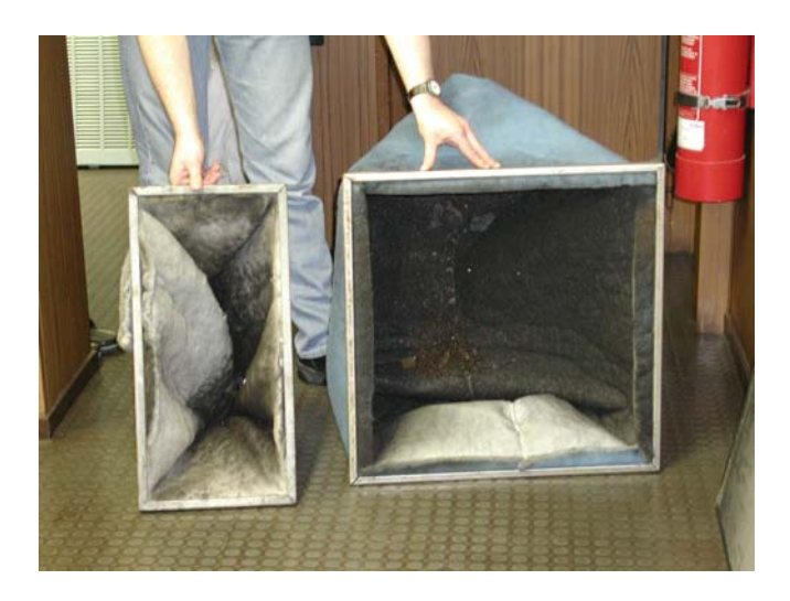
Figure 2: Bag filter, supply air filter of the HVAC installation