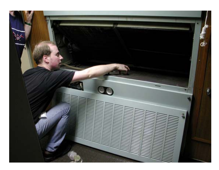
Figure 4: Analysis of contact samples from the air-refrigeration installation of the engine control room

Possible microbial contamination of surfaces was assessed by analysing contact samples from the interior of the HVAC installation and the air-refrigeration installation ( Figure 4 ) and from the supply air terminal units in the cabins. Furthermore, the colony counts of bacteria, mould fungi and yeasts were determined in material samples from the supply air filters (bag filters) of the HVAC installation ( Table 6 ).